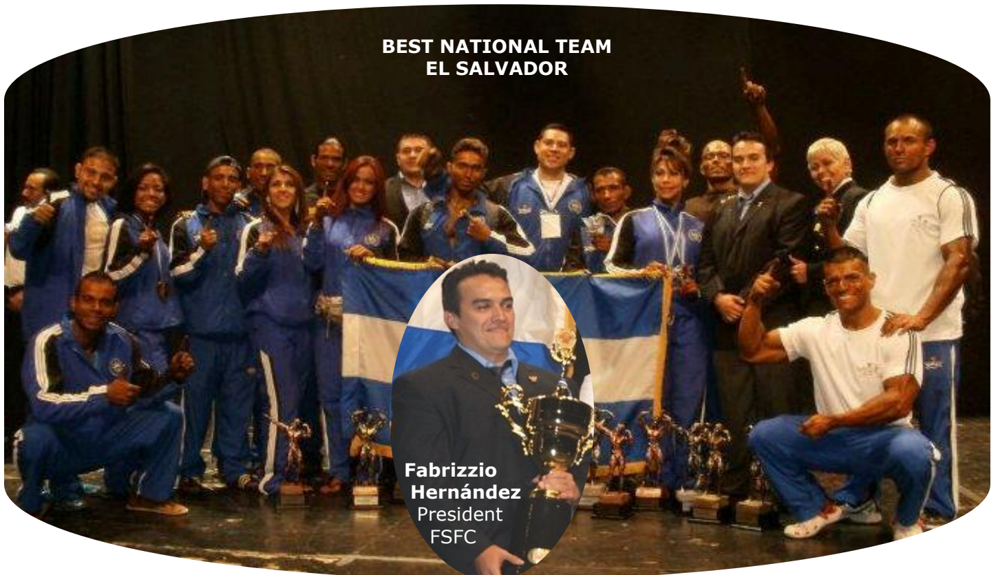
BEST NATIONAL TEAM EL SALVADOR